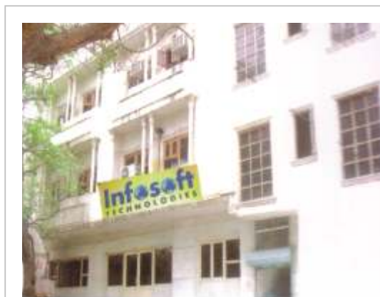
New Delhi, India